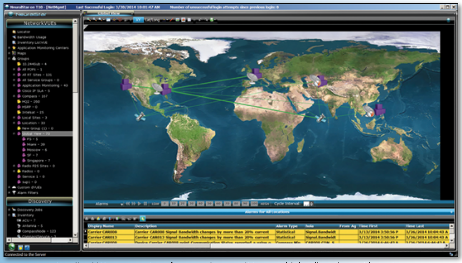
NeuralStar SQM manages service performance and customer SLAs across global satellite and terrestrial operations.

Maintain and Grow Revenue —NeuralStar SQM identifies high-priority problems quickly and helps operational staff respond based on business impact such as revenue, profitability, service and customer experience. It enables organizations to manage more services, launch new services and maximize SLAs to maintain and increase revenue.