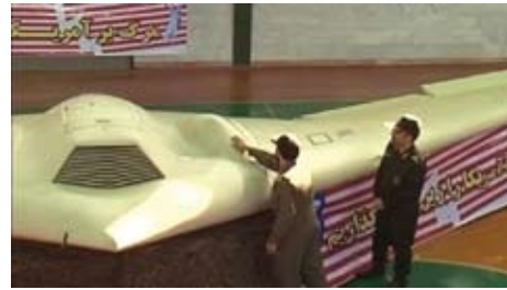
Figure 1. The RQ-170 Sentinel drone purportedly downed by Iran in December

The basic RF communication issue in the case of the purported UAV attack is interference: an unauthorized signal transmitted within a frequency range allocated for an authorized purpose. What does it mean to test for "worst case" interference? Sometimes interfering signals have low power levels, and they degrade the quality of the data received on the other end of the link. However, high power interference can cause total loss of data at the receive site. Reportedly, the American UAV was blinded by a high power interfering signal in its control channel. Clearly, it is necessary to test modems, radios, and other communication equipment under interference of all severities, including the case when the link is