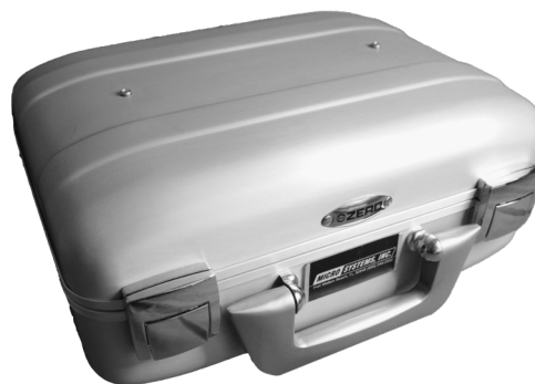
Ready to Transport