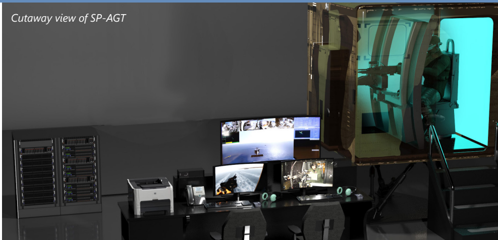
Cutaway view of SP-AGT

Learn more about Kratos' simulator training programs by contacting us at +1.407.678.3388 or Training@KratosDefense.com .