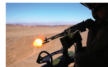
Hands-on Weapons Training

“Rotary Wing Aircraft Threat Avoidance” utilizes VTRAT for rotary aircraft. Scan patterns for day/night environment and standard operating procedures are honed to better anticipate and respond to mission specific threats.