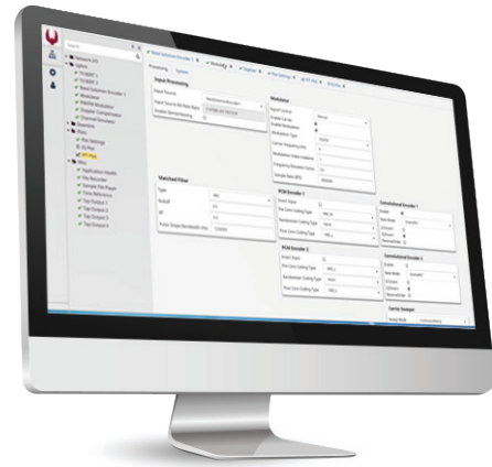
The OpenSpace quantumRadio is a software-based radio for TT&C and narrowband payload missions.