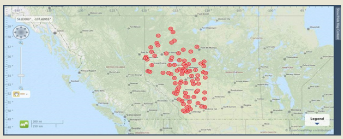
▲ Terminals are geolocated in a TDMA network using Monics satID.

Accelerate troubleshooting efforts by not only identifying the specific VSAT terminals causing interference, but also geolocating their exact location using the terminal ID.