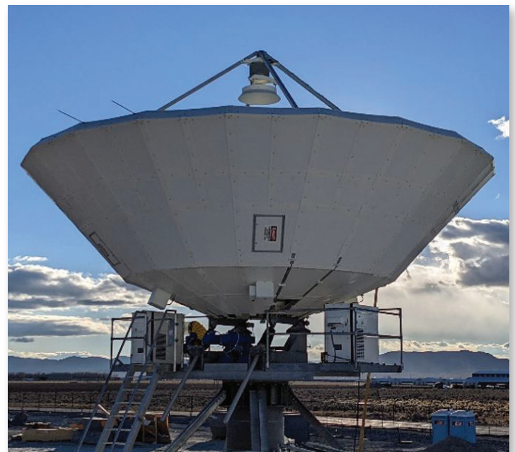
A Kratos antenna installed with proprietary subreflector tracking technology.

Astranis was selected by PDI as the satellite manufacturer and service provider for the Aurora Network because of their innovative and software defined MicroGEO satellite, Arcturus.