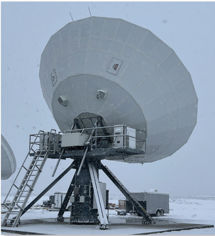
Highly ruggedized options support reliable operations in harsh environmental conditions.

extreme temperature and weather challenges of the area. Kratos' highly ruggedized antenna options were selected by PDI to meet those challenges and minimize any service interruptions due to weather.