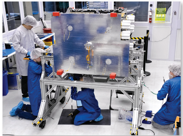
Astranis' first ever Arcturus MicroGEO satellite.

The Arcturus MicroGEO satellite is now in final assembly and set for launch in the winter of 2022.